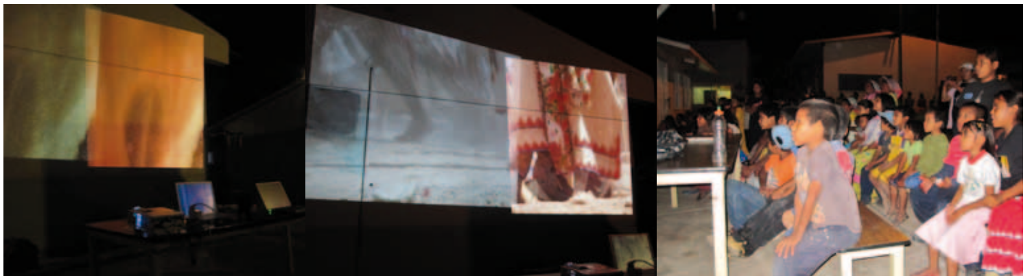
«Danzar o Morir» Performance, Chihuahua, Asentamiento Raramuri. September 2010