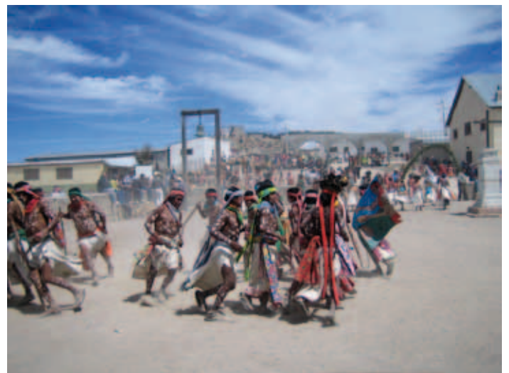
Field Recording, Norogachi, Sierra Tarahumara